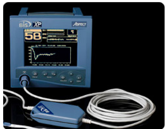
Figure 2. Bispectral index uses processed electroencephalogram signals to measure the depth of sedation on a scale from 0 to 100 (0—coma, 40–60 general anesthesia, 60–90 sedated, 100—awake).