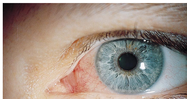
Figure 1. Sectorial conjunctival and episcleral injection nasally, left eye.