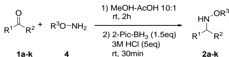
Table 2. 2-Picoline borane-mediated reductive alkoxyamination of carbonyl compounds 1 with alkoxyamine 4

without recovering the corresponding oxime ether. This method was applied to the alkoxyamination of various carbonyl compounds. Representative results are summarized in Table 2.