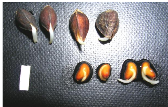
Figure 1. Interaction of buckwheat and cress seeds. Left: buckwheat seeds, Center: buckwheat seeds (upper) were cultured with cress seeds (below), Right: cress seeds. Ten seeds of the same or different species were cultured in a Petri dish in the dark for 1 day. Bar; 5mm

Figure 1 shows interaction of buckwheat and cress seeds. Radicle growth of cress seeds was significantly inhibited by buckwheat seeds, whereas radicle growth of buckwheat seeds was not affected with cress seeds. These results suggest that allelochemical(s) inhibiting the radicle growth of cress seeds are exuded from germinating buckwheat seeds into the culture solution. An allelochemical, which showed inhibitory activity for the radicle growth of cress seeds, was isolated from the exudates of germinating buckwheat seeds. The 1 H and 13 C NMR spectra of the isolated compound were absolutely identical with those of authentic caprolactam, hexahydro-2H-azepin-2-one (Figure 2). Caprolactam, a precursor in the fabrication of 6-nylon (perlon L), 13 had