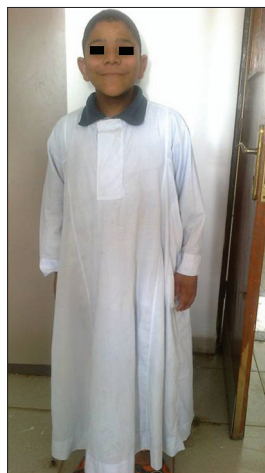
Figure 1: Egyptian child with Berardinelli-Seip syndrome type 1

his lipid profile revealed cholesterol - 339 mg/dl (114-203 mg/dl), high-density lipoprotein <20 mg/dl (40-60 mg/dl), low-density lipoprotein - 223 mg/dl (<130 mg/dl), triglycerides - 844 mg/dl (29-99 mg/dl). Complete blood picture and levels of blood urea nitrogen and creatinine were within the normal range. Liver function tests revealed bilirubin 11 \mu mol/l (normal <20 \mu mol/l), alanine aminotransferase 186 IU/l (normal <50 IU/l), aspartate aminotransferase 123 IU/l (normal <50 IU/l); alkaline phosphatase 108 IU/l, (normal <350 IU/l); albumin 38 g/l (normal range: 35-45 g/l). Viral hepatitis B and C screens were negative. Ultrasonography and magnetic resonance imaging (MRI) of the abdomen revealed an enlarged fatty liver, splenomegaly, absence of visceral fat with no evidence of portal hypertension. Cranial MRI showed normal findings. His growth hormone levels were within normal range in several measurements (0.2-