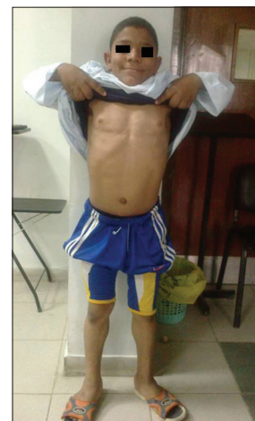
Figure 4: Prominent pectoral and calf muscles