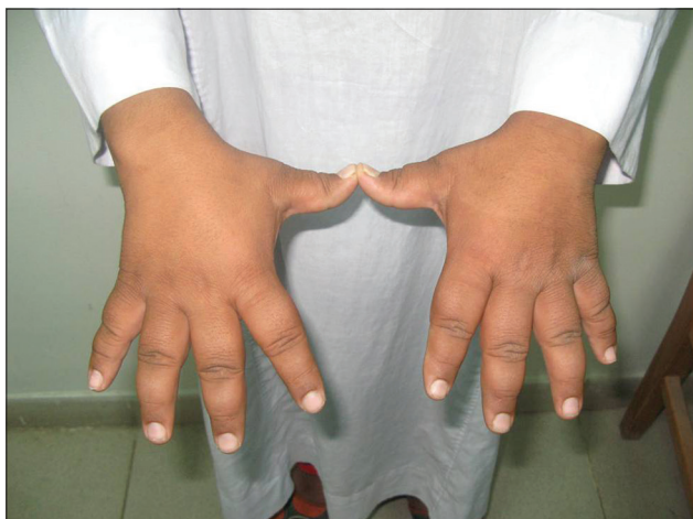
Figure 3: Large hands