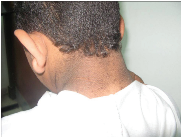
Figure 5: Acanthosis nigricans of the neck

1.1 ng/mL). Serum insulin-like growth factor-1 (IGF-I) level was also normal. Other hormone levels were normal these findings ruled out the diagnosis of acromegaly. Echocardiogram was normal. In view of the typical dysmorphism, age of onset, normal mentality, hepatomegaly, diabetes mellitus, acanthosis nigricans and hypertriglyceridemia, the diagnosis of BSCL1 was kept. [6] Molecular genetic study revealed AGPAT2 mutations which are responsible for BSCL1. Our index case was started on a combined regimen of insulin, metformin and encouraged to do more physical activity. After 3 months of the above management, his blood sugar was maintained between (200-255 mg/dl), HbA1c: 8.2% and triglyceride level of 120 mg/dl.