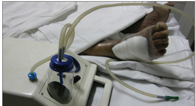
Figure 2: Showing machine used to create negative pressure