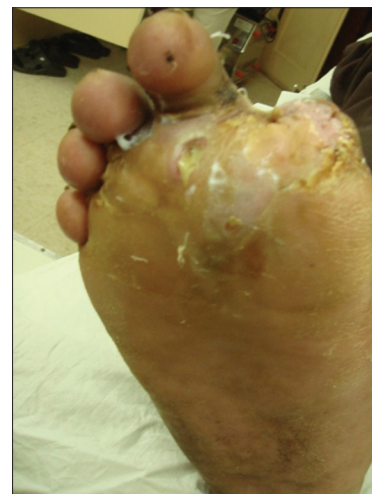
Figure 4: Postoperative picture of the healed ulcer

study group had discharge at the end of 7th and 8th week as compared to 33.33% and 26.67% of patients in control group, respectively. This could be attributed to the faster rate of wound closure in the study group. In a similar study conducted by Tamhankar et al. , [14] in four patients with mesh-related infection after abdominal wall hernia repair which were treated by NPWD therapy, it was seen that NPWD therapy allows salvage of infected exposed mesh by clearing the purulent discharge promoting granulation tissue formation.