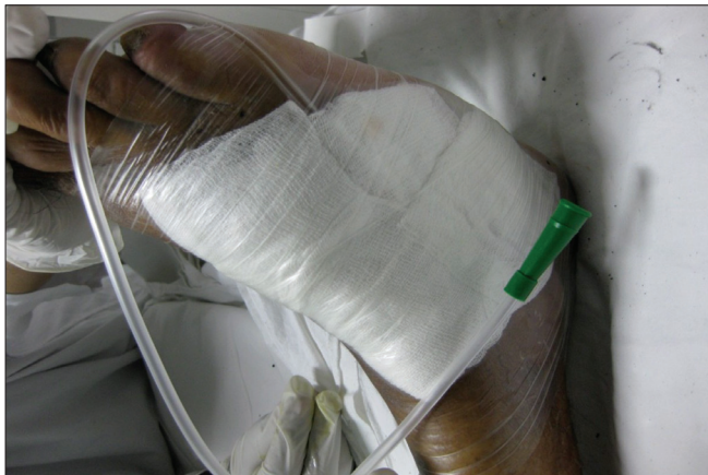
Figure 1: Showing application of negative pressure wound therapy