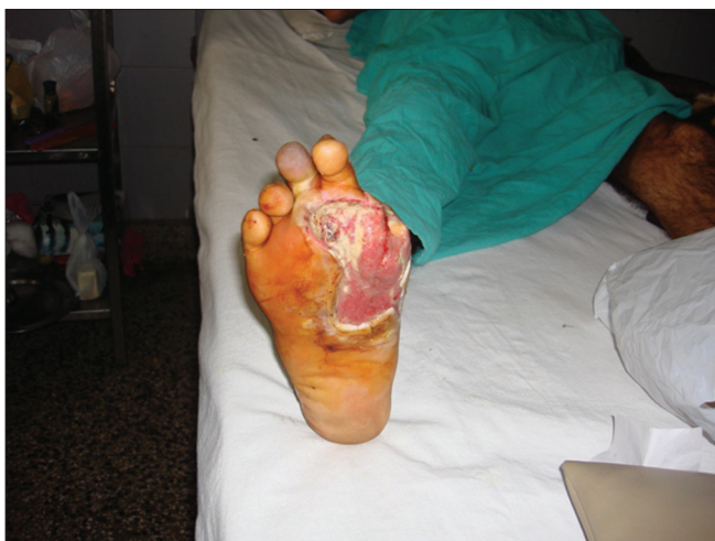
Figure 3: Diabetic ulcer treated with negative pressure wound therapy