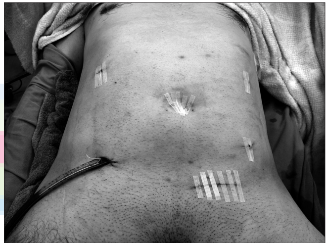
Figure 4: At the end of the operation, the patient had only a hernia repair wound and five trocar wounds

wound was irrigated with a copious amount of saline. Thereafter, the hernia sac was ligated in the neck and the inguinal hernia was repaired with a mesh [Figure 4]. His postoperative course was uneventful without surgical site infection, and he was discharged ten days after the operation.