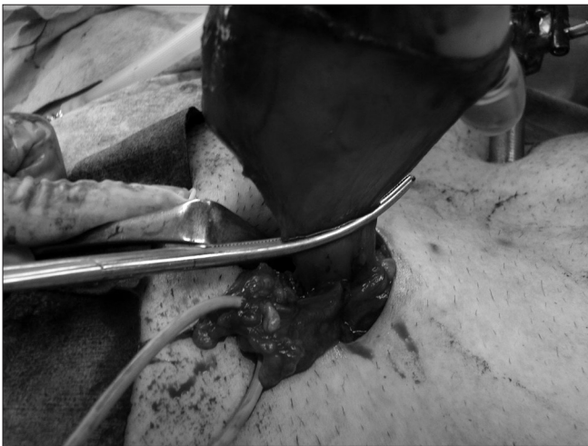
Figure 3: After the hernia sac was clamped with Kelly forceps, pneumoperitoneum was re-established