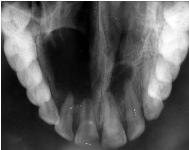
Figure 1: Preoperative radiograph