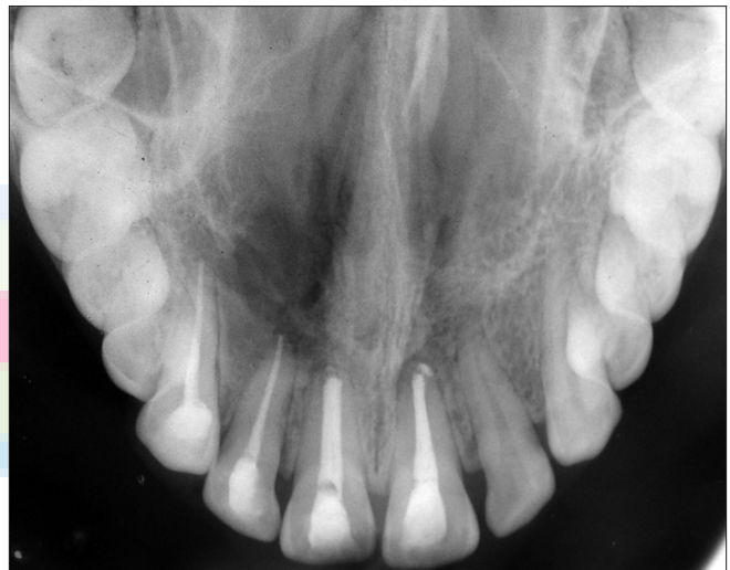
Figure 4: Radiograph at the 1½-year follow-up

The patient was free from all symptoms and signs with optimum tissue healing at the 6-month follow-up visit. Radiographic examination revealed decrease in the size of periapical radiolucency bilaterally. Tooth 21 was obturated with zinc oxide eugenol sealer and gutta-percha using lateral condensation technique. Esthetic rehabilitation of 11 and 21 was done. A radiographic review at the 1½-year follow-up showed good evidence of bone healing bilaterally [Figure 4].