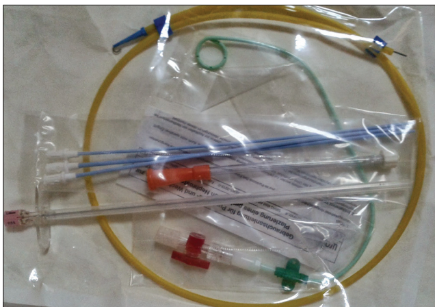
Figure 1: Photograph of the percutaneous nephrostomy set

The age ranged from 2 to 72 years with a mean of 43.6 years. A total of 22 (68.75%) patients had PCD, while 10 (31.25%) had PNA. A total of 15 (46.87%) patients had single abscess [Figure 3], while 5 (15.63%) had two and 12 (37.50%) had more than 2. Most of the abscesses are located on the right in 25 (78.1%). One needle insertion was used per patient. The amount of aspirated pus ranged from 100 to 3000 mL with a mean of 850 mL. A total of 14 (43.75%) patients have aspirated fluid less than 500 mL (small abscesses), while 18 (56.25%) have more than 500 mL (large abscesses). The average duration of aspiration of fluid range from 1 to 8 h with a mean of 2 h. The patient with 3000 mL of pus was done over a period of 4 days with a total aspiration time of 8 h. Only 10 (31.25%) patients were on admission during the time of drainage, while the others 22 (68.75%) were day cases.