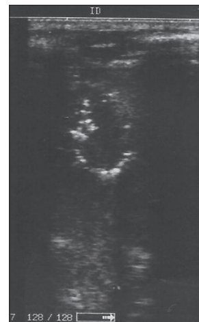
Figure 2: Sonogram of the liver with a drainage catheter, in a collapsed abscess cavity